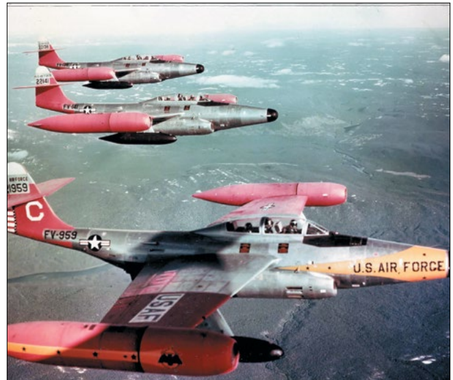
F-89D Scorpion Interceptors from the 1950s belonging to Air Defense Command.

Antecedents: AAF Materiel and Services 1944; AAF Technical Service Command 1944; Air Technical Service Command 1945; Air Materiel Command 1946; Air Force Logistics Command 1961. Inactivated July 1, 1992.