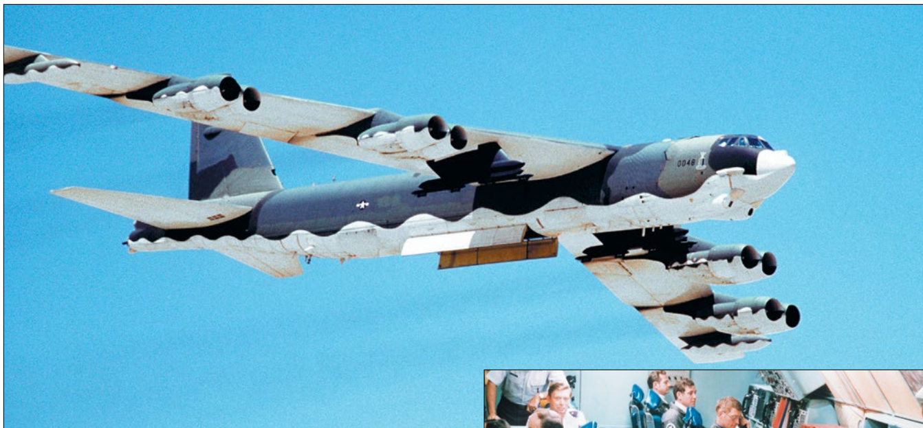
A SAC B-52H Stratofortress during the multinational joint service Exercise Bright Star '85 out of Cairo West AB, Egypt.