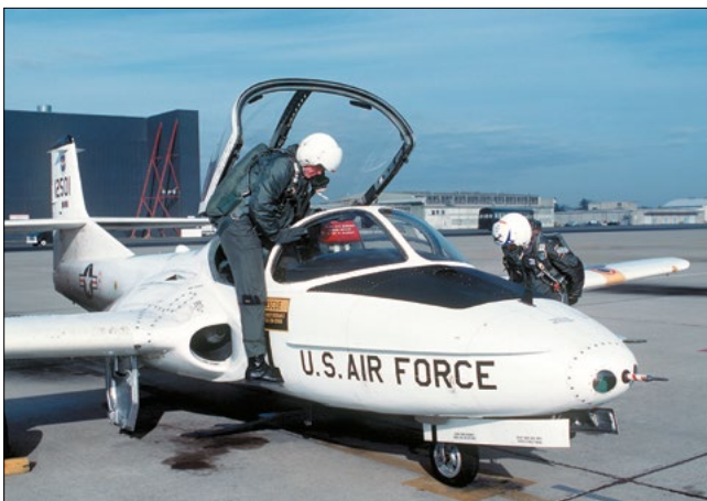
A student and instructor pilot at Air Training Command's undergraduate navigator school prepare for flight in a T-37 aircraft at Mather AFB, Calif.

Established Dec. 1, 1948. Inactivated Aug. 1, 1968.